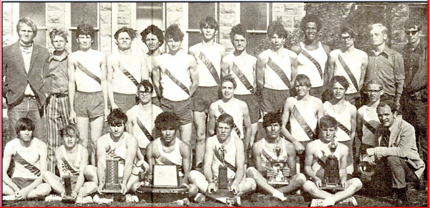
1972 Track Team