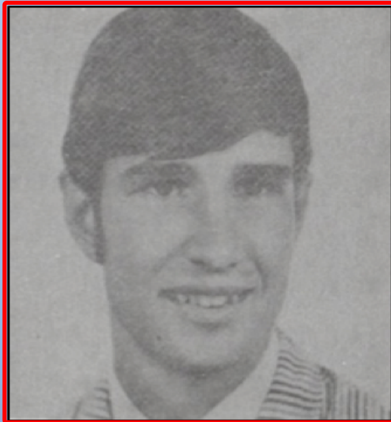
Donald Sutton - 1970